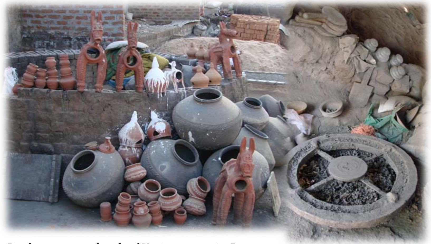
Product range and tools of Varia community Potters